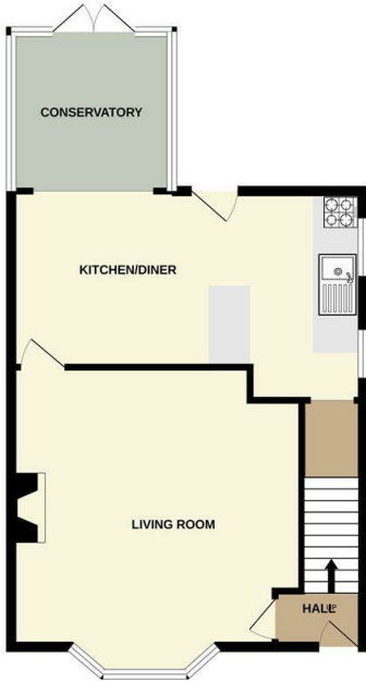
GROUND FLOOR 611 sq.ft. (56.7 sq.m.) approx.